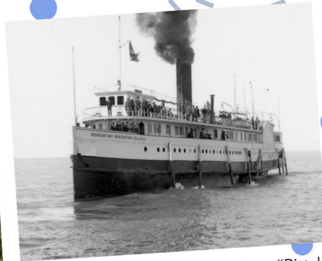
A992.022.1013- Kincardine Area "Pittsburg"

In 1904, a pair of range lights were erected in Stokes Bay to help guide vessels between Lyal Island and Mad Reef, replacing a pair of day beacons in the Municipality of Northern Bruce Peninsula . In December 2009 the larger light was decommissioned by the Canadian Coast Guard and moved to the Bruce County Museum & Cultural Centre! A team of Volunteers spent hundreds of hours restoring it using traditional paint and craftsmanship.