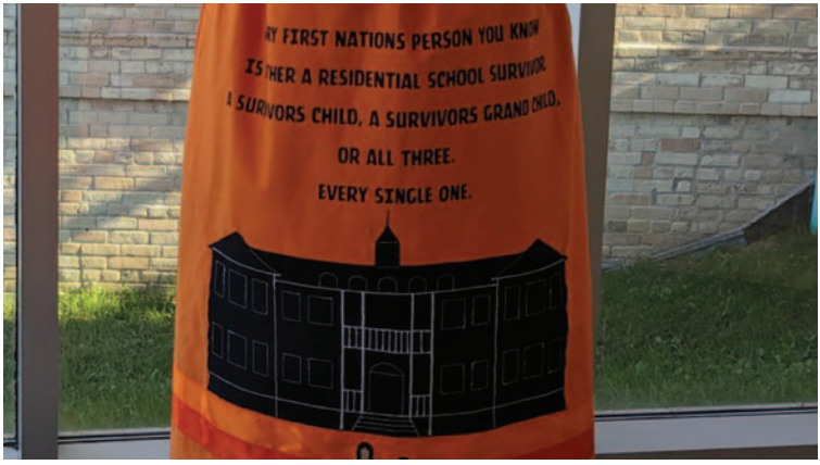
Ribbon Skirt in recognition of Truth and Reconciliation Day