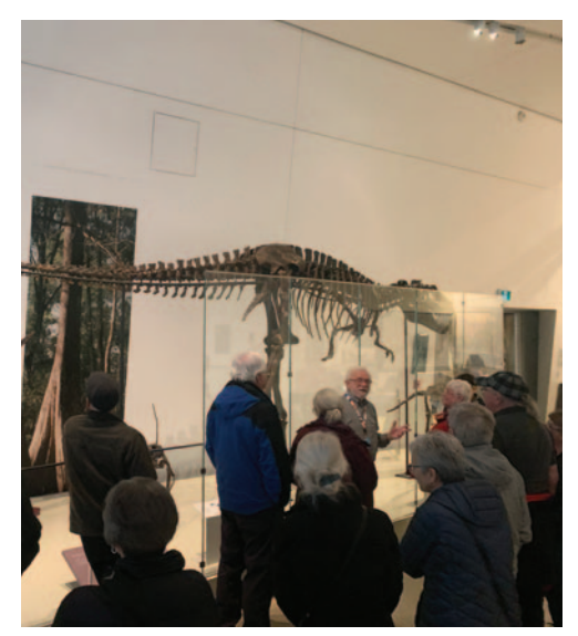
ROM Bus Trip: A group of seniors enjoys their first tour at the Royal Ontario Museum.