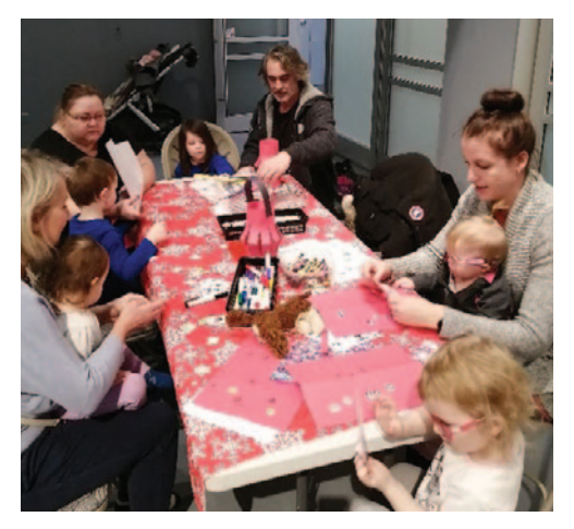
Museum Munchkins with their parents and guardians working on a craft.