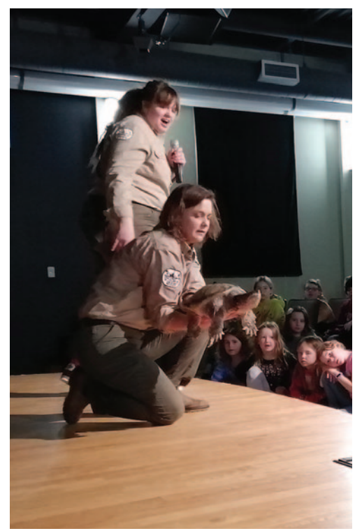
March Break campers carefully watch a snapping turtle during the Speaking of Wildlife show.