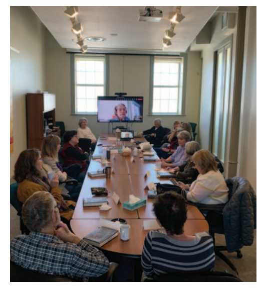
Break Out of the Bruce Book Club participants meet to chat about the selected novel.