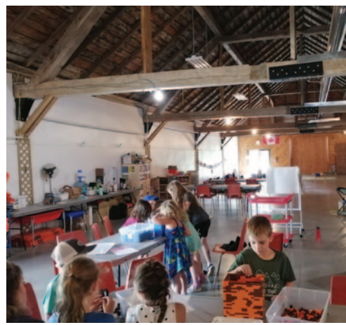
Paisley Kids and Us campers build a LEGO™ tower during their design challenge program.