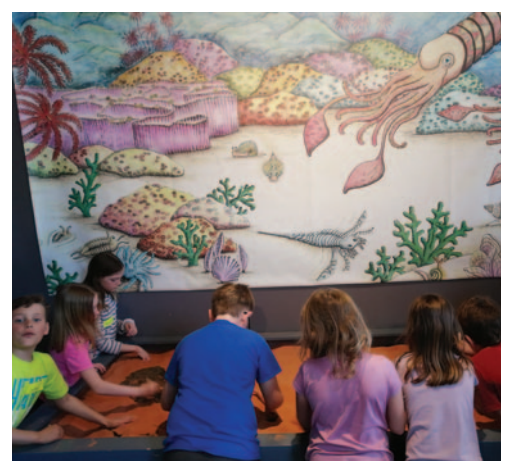
Grade 3 and 4 students from Arran-Tara Elementary School dig for fossils.