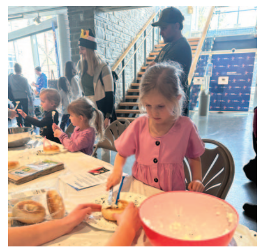
Making eco-bird feeders during Family Day!