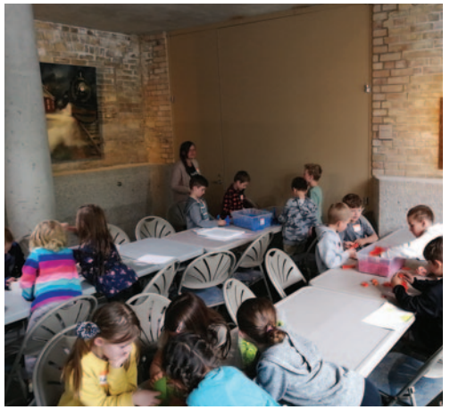
Students build a LEGO<sup>™</sup> tower during a design challenge program.