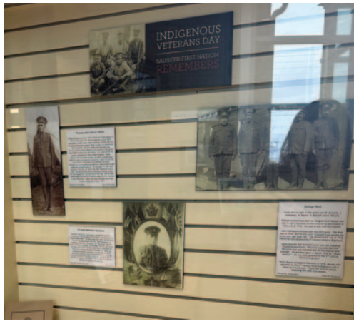
Saugeen First Nations Indigenous Veterans Day Display