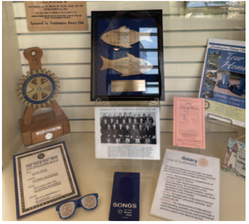
85th Anniversary of Southampton Rotary Club