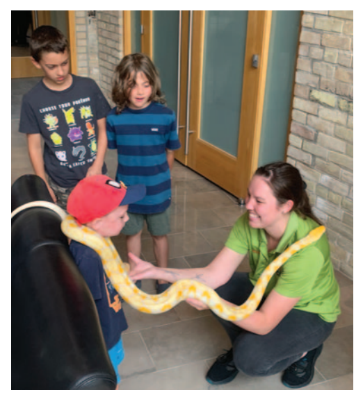
Hanging out with reptiles during this summer's Wonderful Wildlife shows.