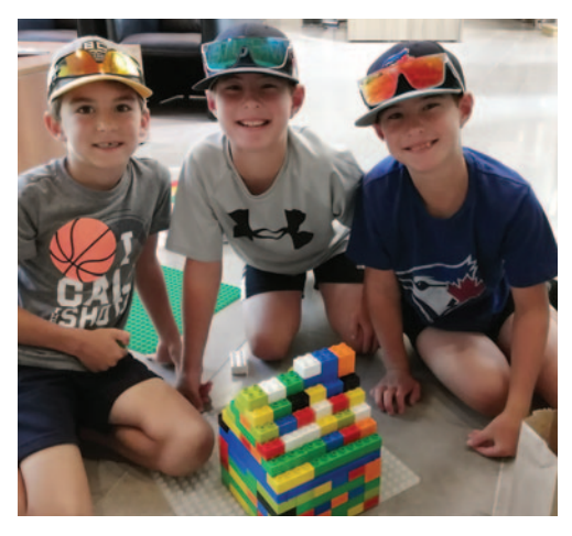
Museum campers work together on a DUPLO® building.