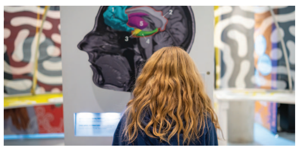
Visitors explore the mysteries of the teenage brain in our summer exhibit, Teens: Creative Minds.