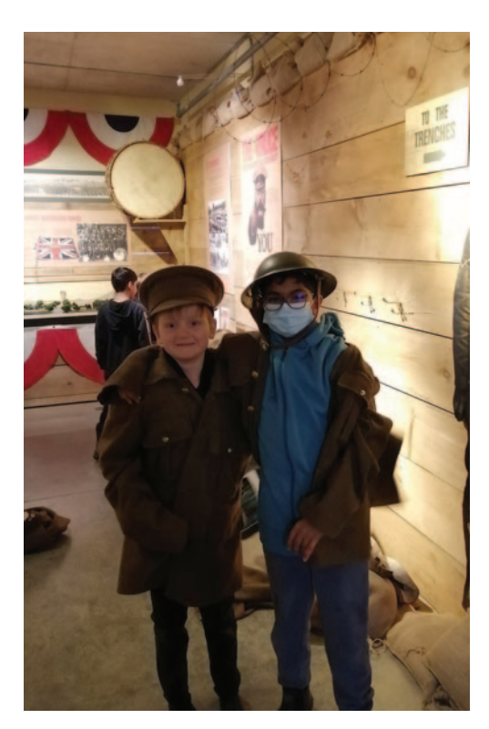
March Break campers go back in time while exploring the Bruce Remembers exhibit.

Check out our online Education Centre for additional learning resources related to BCM&CC exhibits and programs! These resources are suitable for grades 1-12 and are great tools for both educators and parents looking to add to their experience after visiting the Museum.