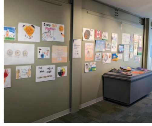
Artwork submissions from local youth inspired by the meaning of Reconciliation.