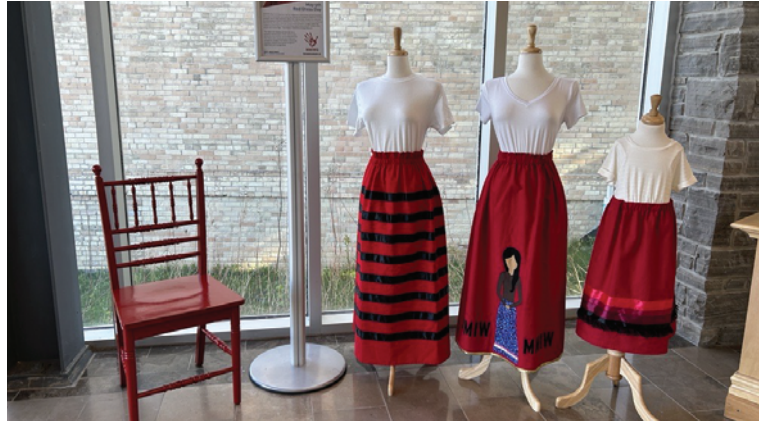
Missing and Murdered Indigenous Women and Girls display